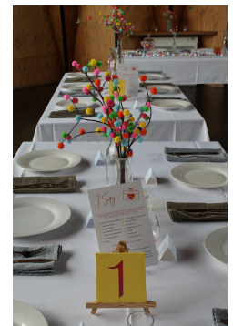
Wedding by: The Event Boutique