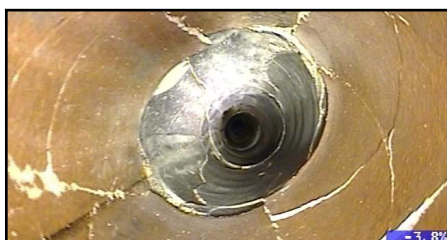
Left A camera trolley and a video of a broken pipe